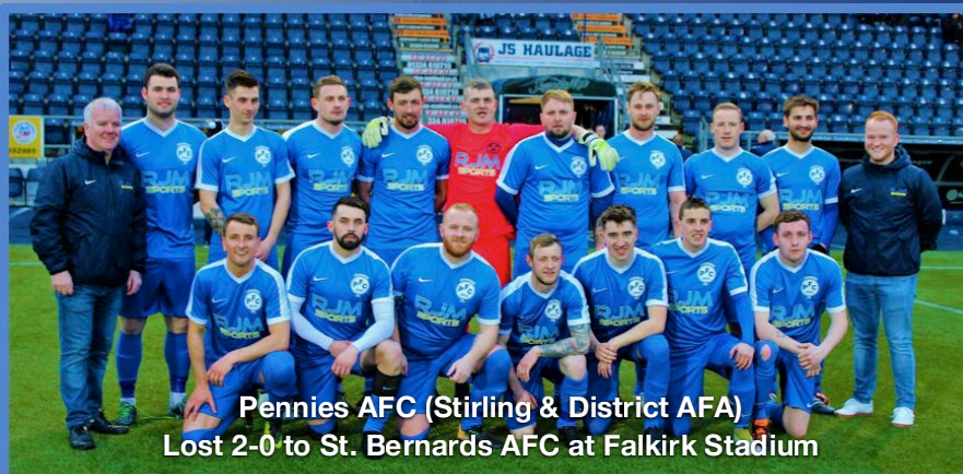
Pennies AFC (Stirling & District AFA) Lost 2-0 to St. Bernards AFC at Falkirk Stadium