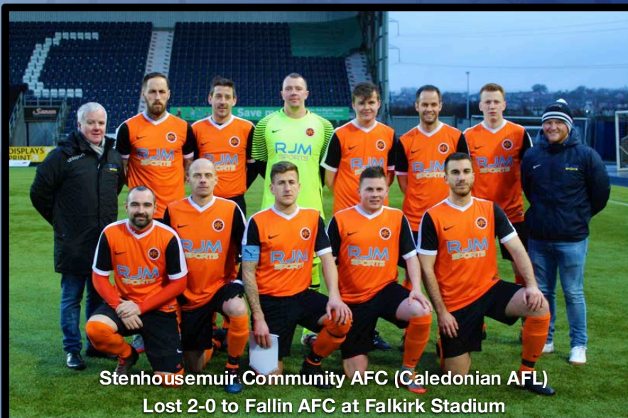
Stenhousemuir Community AFC (Caledonian AFL) Lost 2-0 to Fallin AFC at Falkirk Stadium